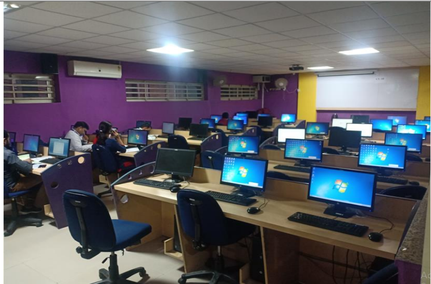
OPERATING SYSTEM LAB