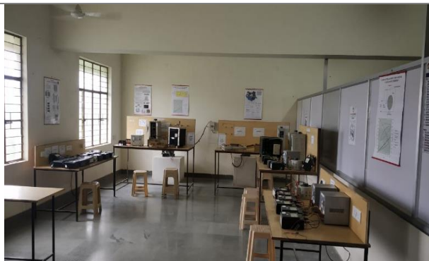
ELECTRICAL MACHINE – I LAB