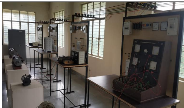
BASIC ELECTRICAL ENGINEERING LAB